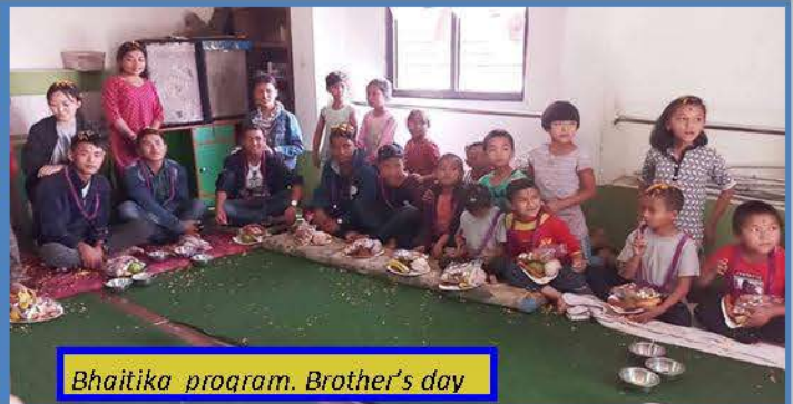
Bhaitika program. Brother's day