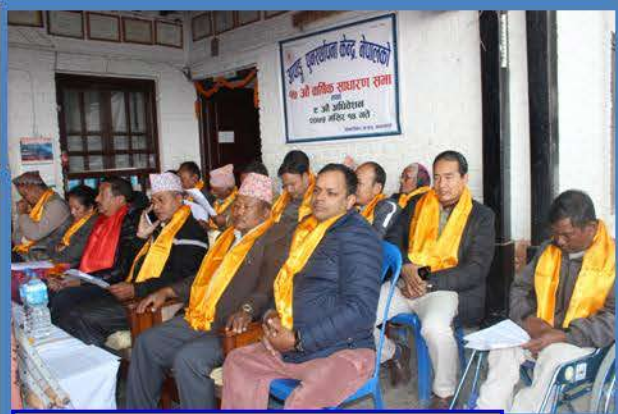
All the special guest, Chairman and staffs.