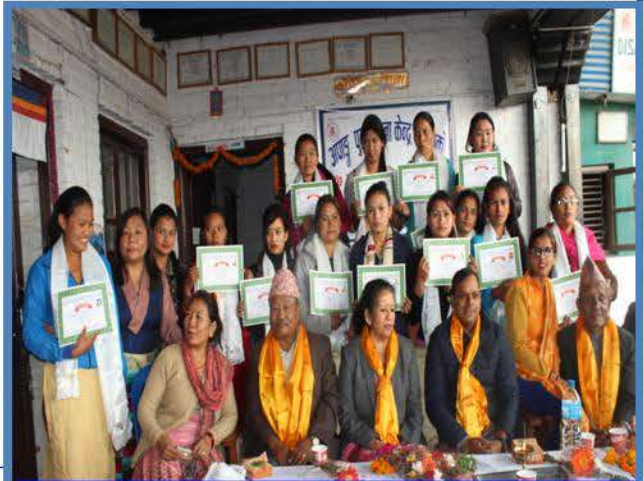
Trainee of vocational skill training with Chairman , guests and with teacher on AGM.

In order to help needy women to improve their skills and to help them for being independent DRC runs everyday two hours sewing training by a experienced trainer. This skills will help them to get employment for a better living ahead. It is a pleasure to see what they are achieving. Every year DRC,Nepal provide certificate to our trainee after they complete their 1 year training. Similarly this year also DRC,Nepal provided a certificate of vocational skill development to all the trainee on the AGM 2075 program. We would like to thank Sponsor Trek Nepal for providing this great opportunity.