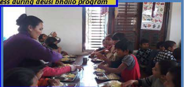
Kids are enjoying food.

“Health is wealth”. So we are always concerned about the health of the kids here in DRC, and with their regular health check ups and the physiotherapy 2 hours each day all the children are in a very good health. We are always teaching them about health and hygiene its benefits and encouraging them to keep the surroundings and rooms clean. Food is more important than anything so we provide them healthy and home made food than junk food.