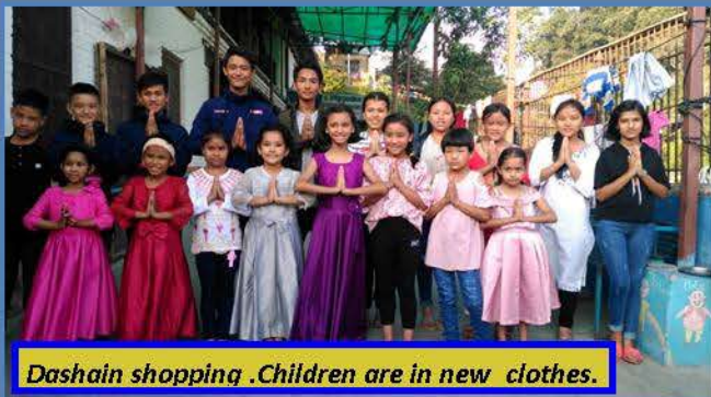
Dashain shopping .Children are in new clothes.

Except from school different kind of activities are also important for a good development of the children. They are always very happy when we organize cultural program ,games or some journeys such like swimming, sightseeing, picnic, etc... This activities are giving them some extra knowledge and experience. Dashain 2075 ,festival shopping was done for the children also on the occasion of Tihar (light) festival we organized cultural dance program by our children. Children really enjoyed so much and happy to get new gifts and new clothes in festival time. We organized this program with aim to raise some more fund for tour and to make children happy.