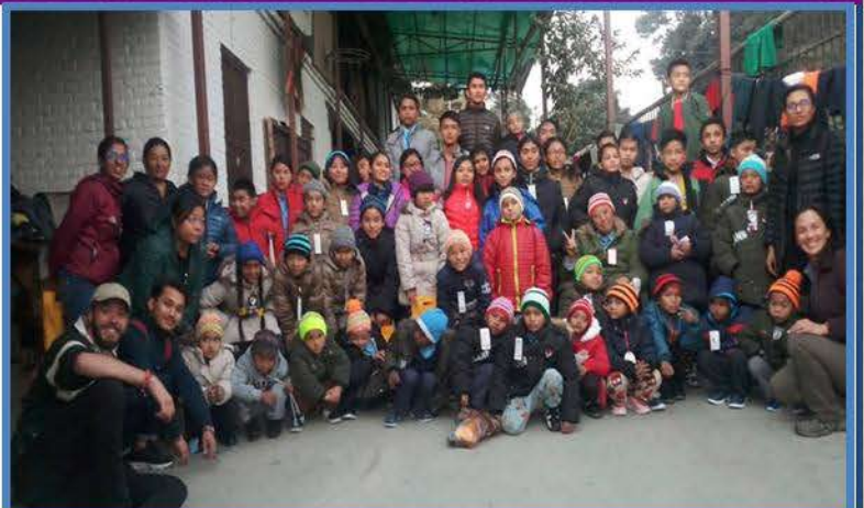
New Jackets, Shoes ,woolen cap for all Children.